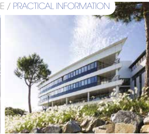
Left to right : CHU d'Amiens – Centre Antoine Lacassagne, Centre de lutte contre le cancer de Nice – Institut de Cancérologie de l'Ouest, Nantes