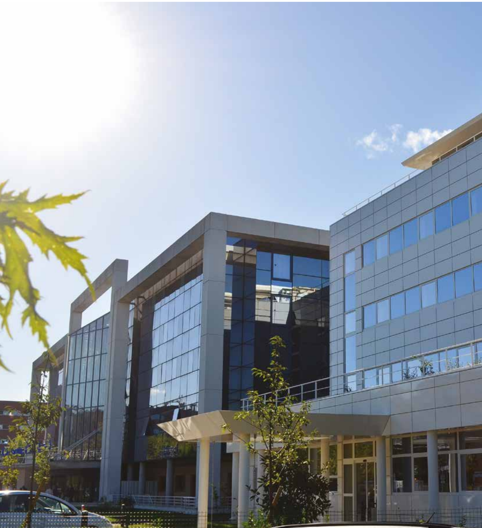
Clinique Claude Bernard, Ermont