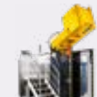
STERILWAVE 900 up to 180kg/h*

*estimated capacity with a waste density of 1kg/dm 3