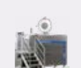
STERILWAVE 440 up to 88kg/h*