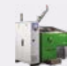
STERILWAVE 250 up to 50kg/h*