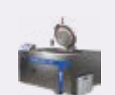
STERILWAVE 100 up to 20kg/h*