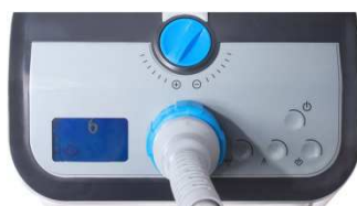
Sensitive switches and LCD control screen