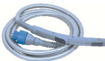
Ergonomic steam hose and handle