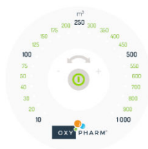
Control touch pad