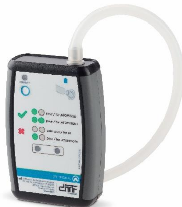
ATOMISOR CONTROL 1 to check the good functioning of your device, ref. MEA1

Class IIa Medical Devices. Carefully read the instructions for use provided with the medical device. Documentation for Health Professionals. Non contractual pictures