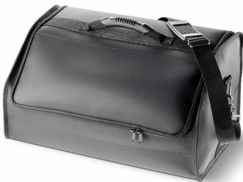
Carrying bag , ref. F64