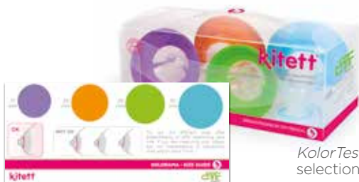
KolorTest, Kolor size selection kit