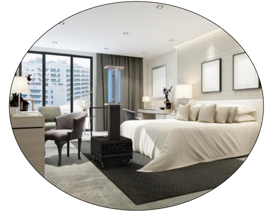
Hotels rooms & Resorts, AirBnB & Vacation rentals