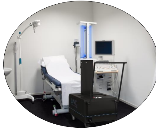
Medical & dental rooms,